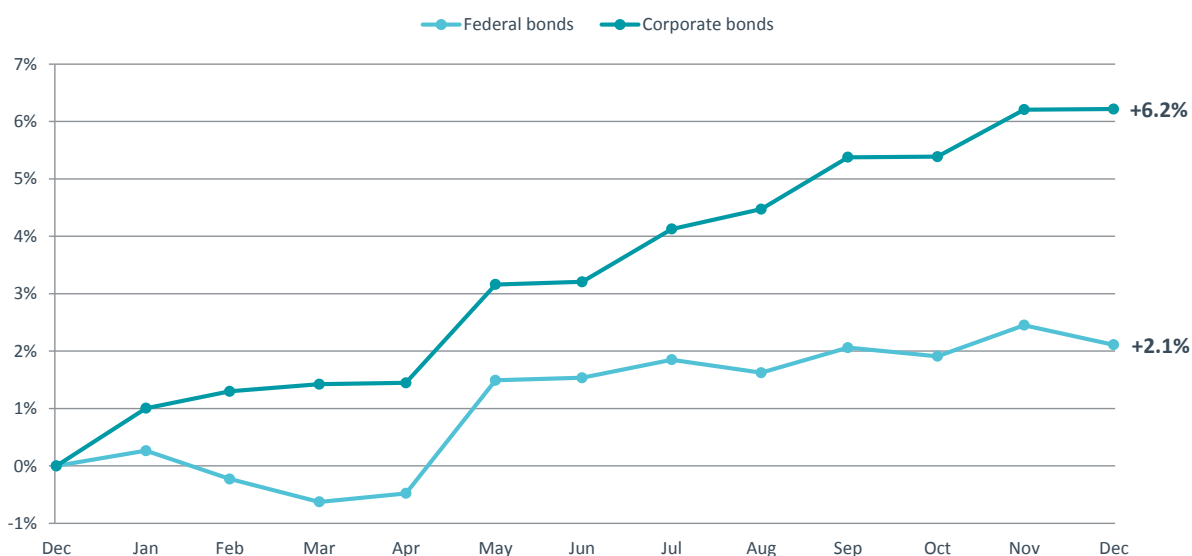
Combined total return of the Canadian bond indexes - 2012

The credit market was more profitable in 2012. Various measures helped stabilize the markets: in Europe the Outright Monetary Transaction program was announced, the European Stability Mechanism was created and progress was made toward the creation of a single banking regulator, while in the United States the Federal Reserve announced new support measures. Investors gradually recovered their appetite for risk, which was especially beneficial to corporate bonds, with a 6.2% total return, but came at the expense of Canadian federal bonds, with a 2.1% total return.